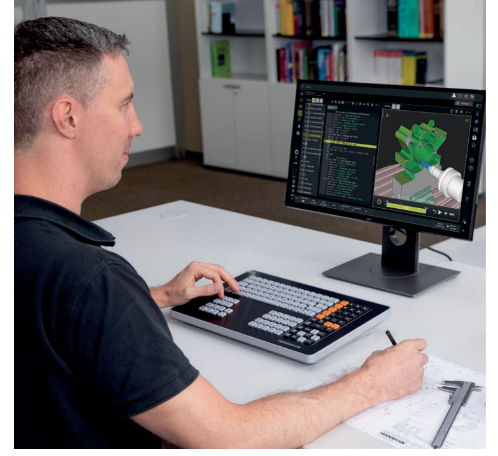
This service is performed for a fee

The TNC7 features a fully touch-optimized user experience. Just like the TNC7 itself, the new programming station operating panel has no separate soft keys. The soft keys are selected via the mouse or by touching the screen.